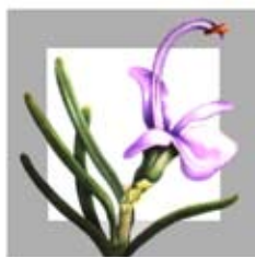
CIDE Centro de Investigaciones Sobre Desertificación Albal (Valencia)